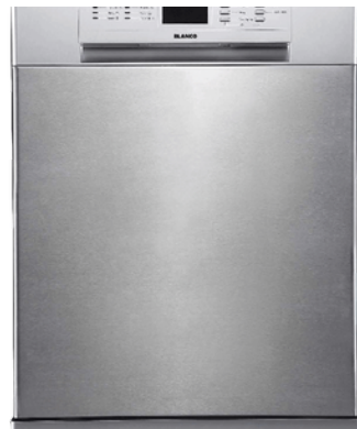
Blanco 60cm Freestanding Dishwasher (BDW126X)