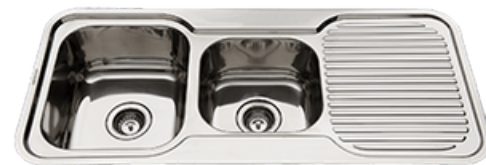
1080mm (W) Chrome Double Sink with drainer