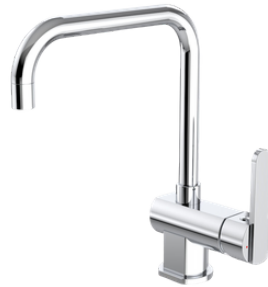
Caroma Saracom Sink Mixer