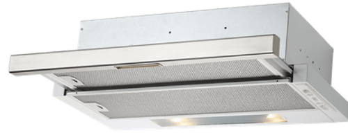
Blanco 60cm Slide Out Rangehood (BRS61X)