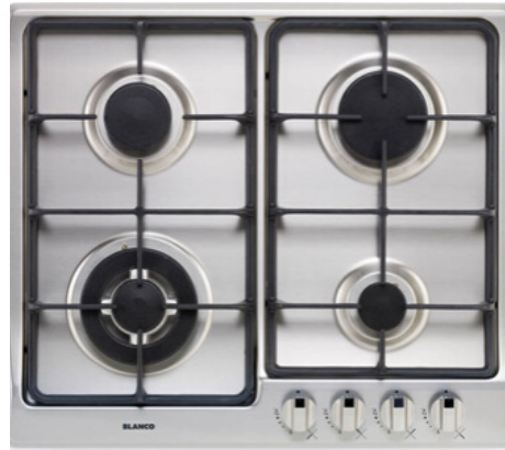
Blanco 60cm 4 Element Gas Cooktop (CG604WXFFC)