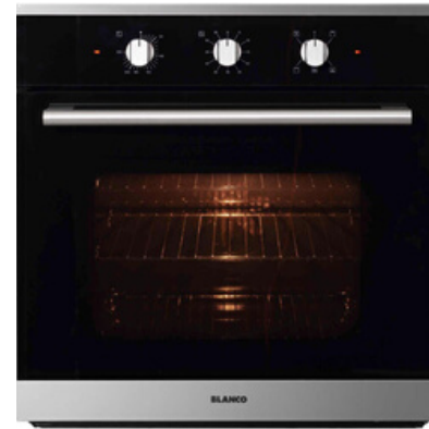
Blanco 60cm Electric Oven (BOSE6511X)