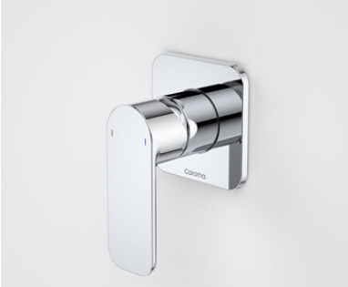
Caroma Luna Wall Mixer