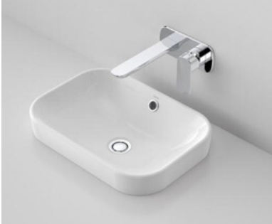
Caroma Luna Inset Basin with Luna wall mounted Basin Mixer