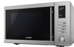
Smeg microwave oven with grill (SA34MX) with trim kit