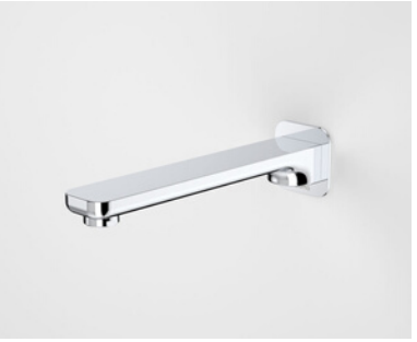
Caroma Luna Bath Spout