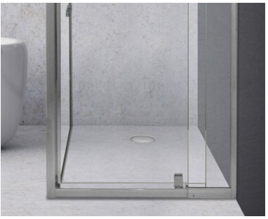
Semi Frameless Shower Screen