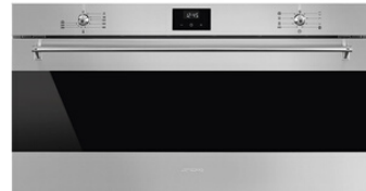
Smeg 90cm Thermoseal Oven (SFRA9300X)