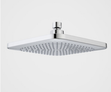
Caroma Contemporary Ceiling Mounted Rain Shower Head