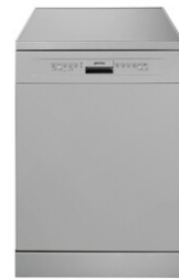
Smeg 60cm freestanding dishwasher (DWA6214S2)