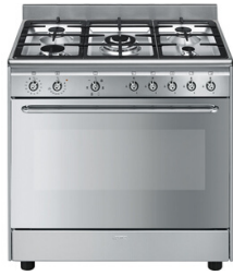
Smeg 90cm Freestanding Cooker (FS9010XS)