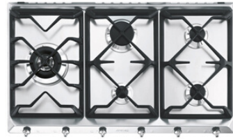
Smeg 90cm gas cooktop (CIR597X5)