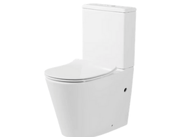
Back To Wall Toilet Suite from Ashmont standard range