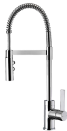
Methven Gaston Pull Down Sink Mixer