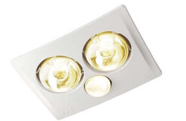
IXL Tastic 3-in-1 Light/Heater/Fan