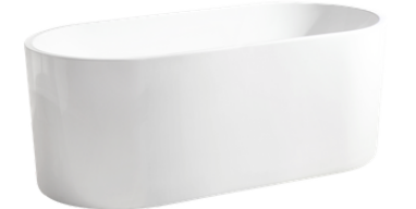
1700mm Freestanding Bath from Ashmont standard range