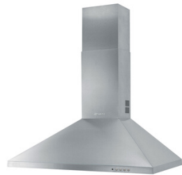
Smeg 90cm wallmount Rangehood (SHW910X1)