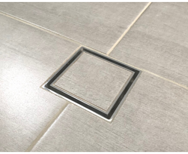
Smart Floor Tile Wastes