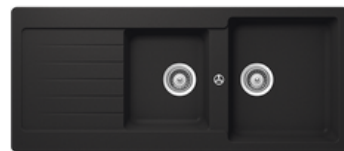
Abey Cristalite Typos Black Overmount Sink